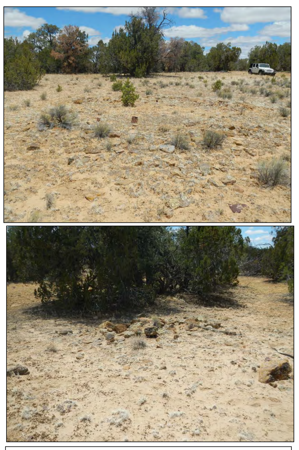
Figure 19: LA 179151 Feature 3 Facing North/Northwest (top) and Feature 4 Facing South (bottom).