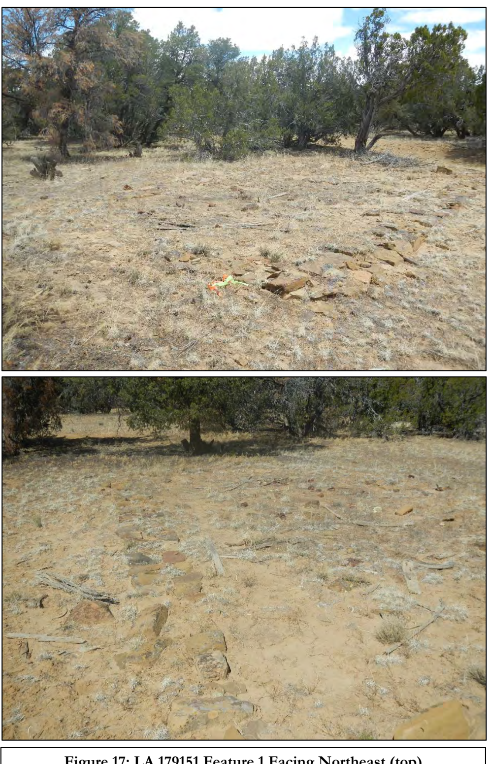
Figure 17: LA 179151 Feature 1 Facing Northeast (top) and Facing West (bottom).