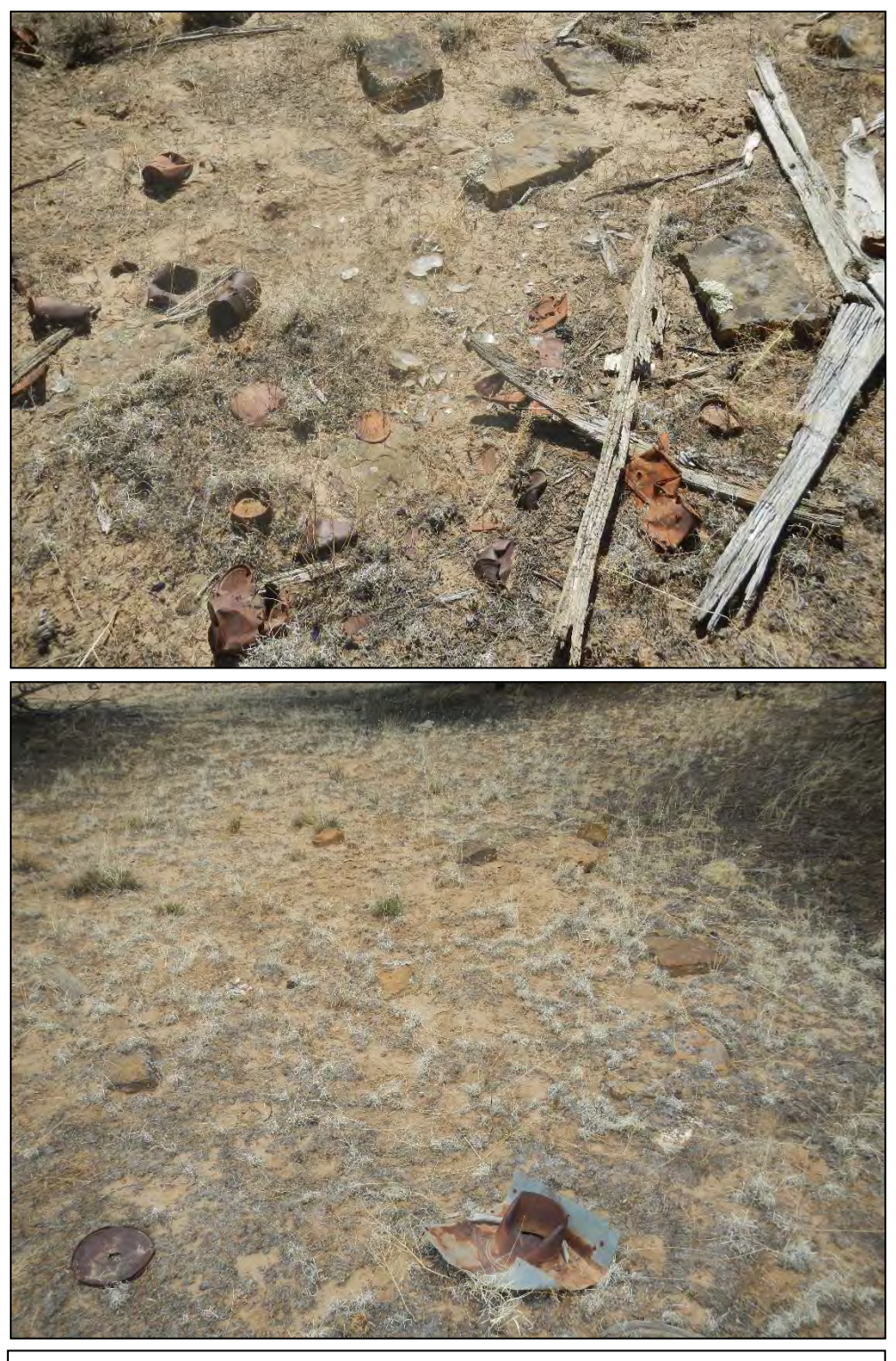
Figure 18: LA 179151 Feature 1 Artifacts (top) and Feature 2 Facing North (bottom).