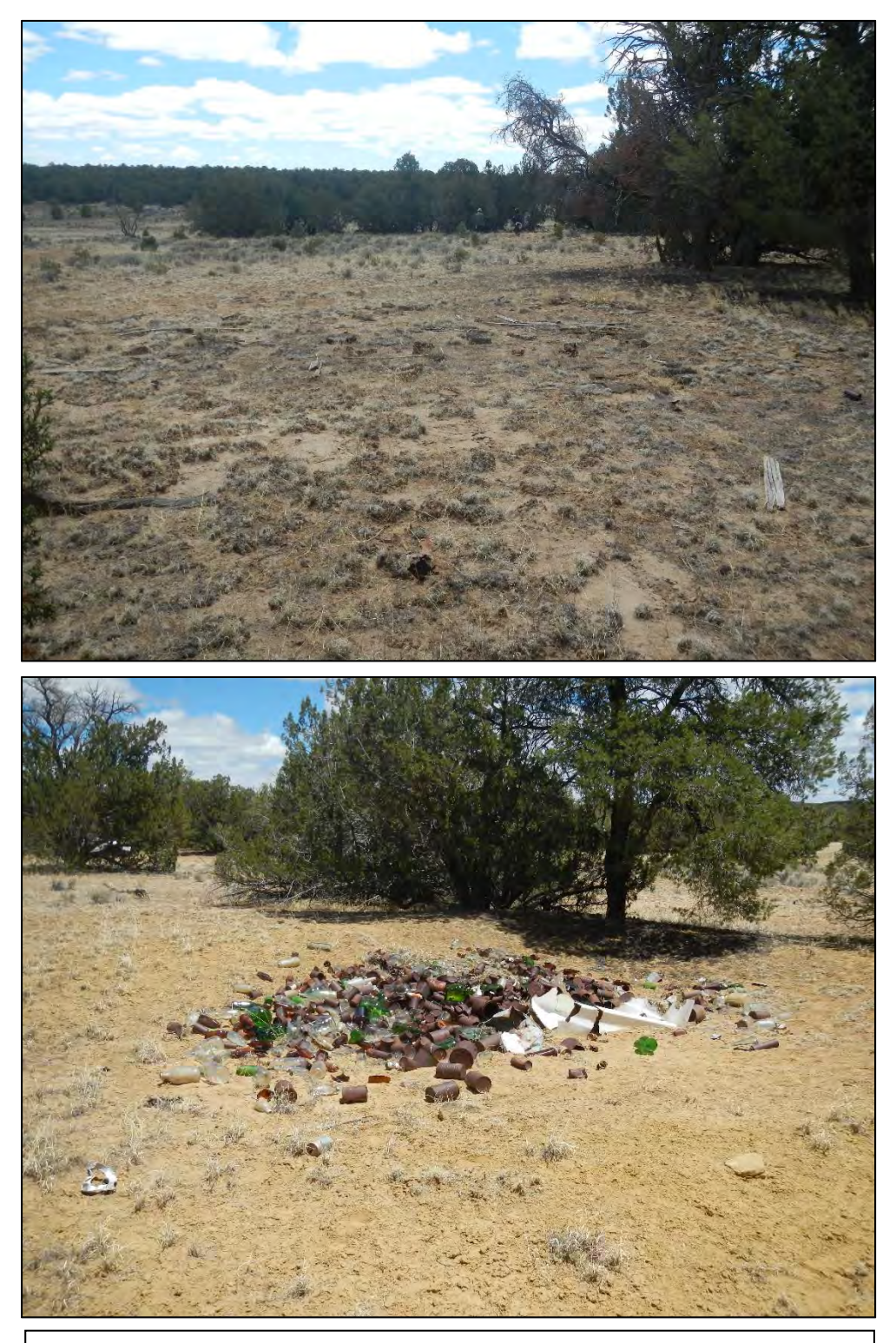
Figure 16: LA 179151 Site Overview Facing Southwest (top) and Modern Dump Facing East (bottom).