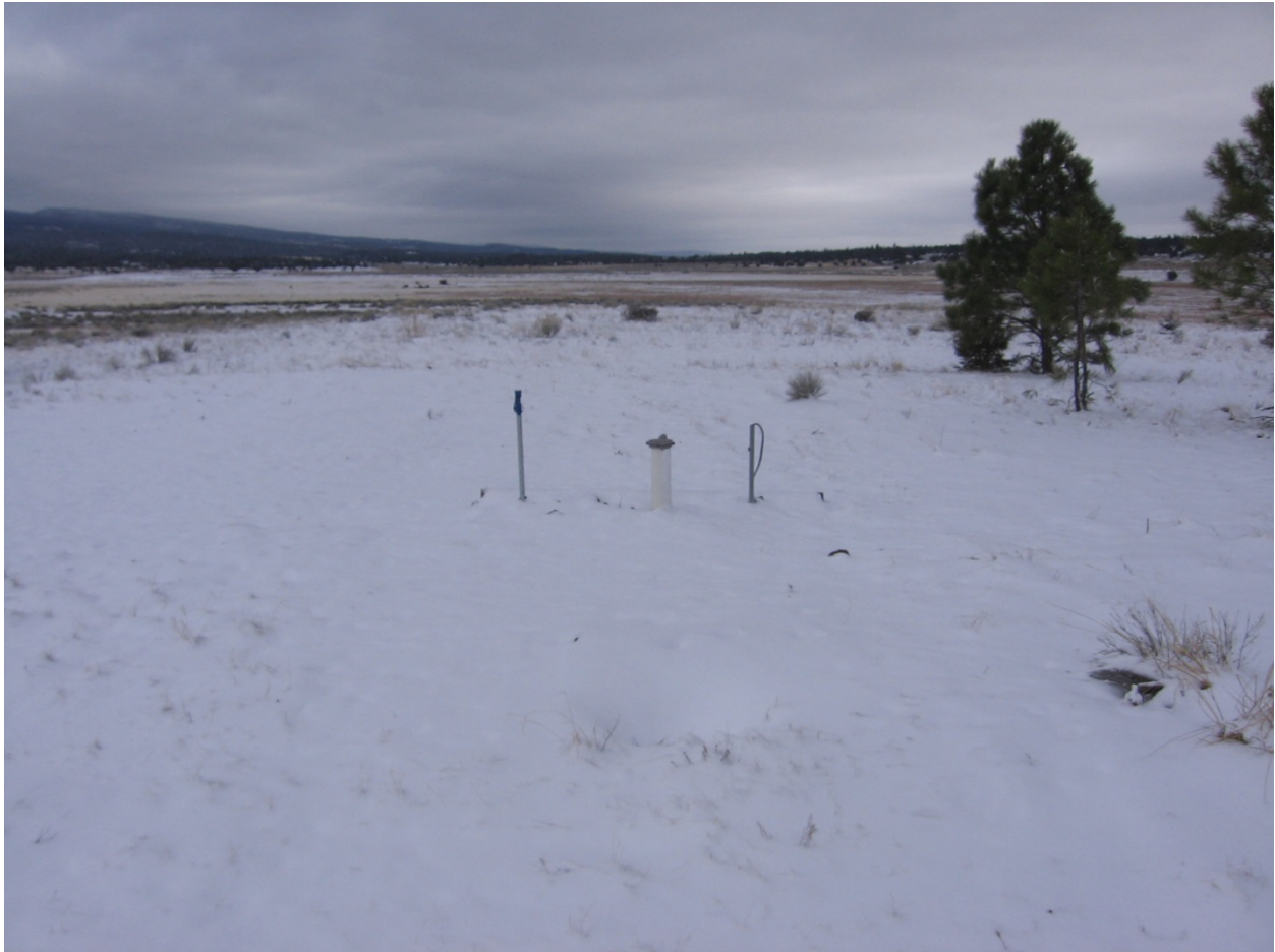
Attachment B – Site photo of well 3B-4-W172 (11/9/2008)